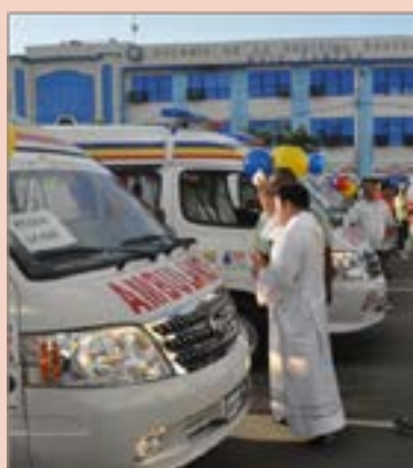
After the turnover, blessing of ambulances were done by their respective parish priest in the Capitol grounds.

PCSO will not be able to accomplish its projects without the continuous support of the Filipinos to lotteries and sweepstakes. They assure the people that the institution will make sure that every part of the charity fund will be used efficiently for the welfare of Filipinos. PCSO provides free ambulances to 4th, 5th and 6th class municipalities, while the 1st, 2nd, and 3rd class municipalities' are required to shoulder 40 percent of the cost of the unit.