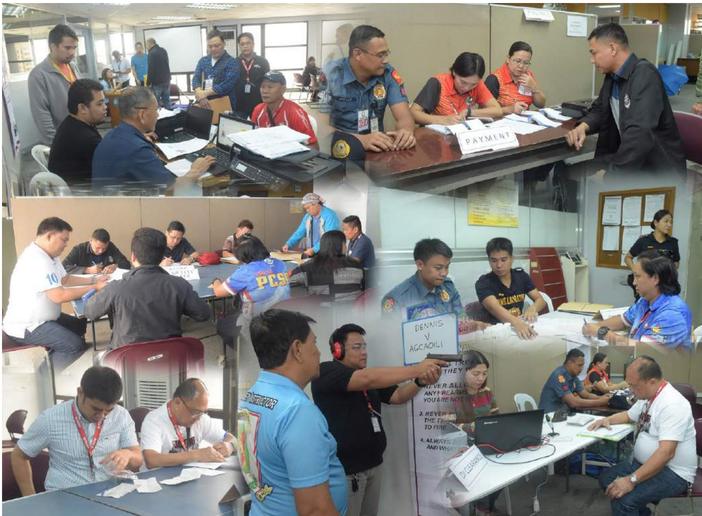
PCSO employees during the step-by-step process of LTOPF application.

The services offered by the PNP personnel are online applications for LTOPF, onsite applications for PTC and LTOPF, firearms renewal, transfer and registration, neuro-psychiatric (interview and exam), PNP Directorate for Intelligence (DI) clearance and drug test.