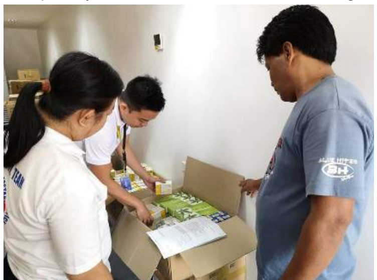
MSD personnel and the representative from the OPG while inspecting the quantity of the medicines.

The PCSO Medicine Donation Program aims to augment the needed medicines of qualified government and non-government agencies to enable them to implement efficient and effective health care services.